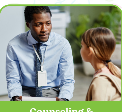
Counseling & Prevention